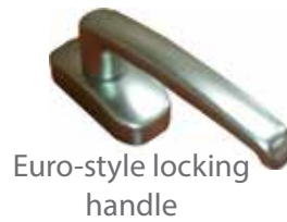
Euro-style locking handle