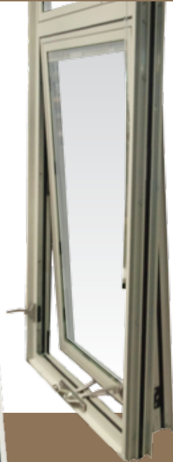
Accessible project-out awning window (Note limited opening)