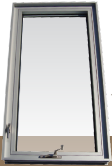
Accessible out-swing casement window